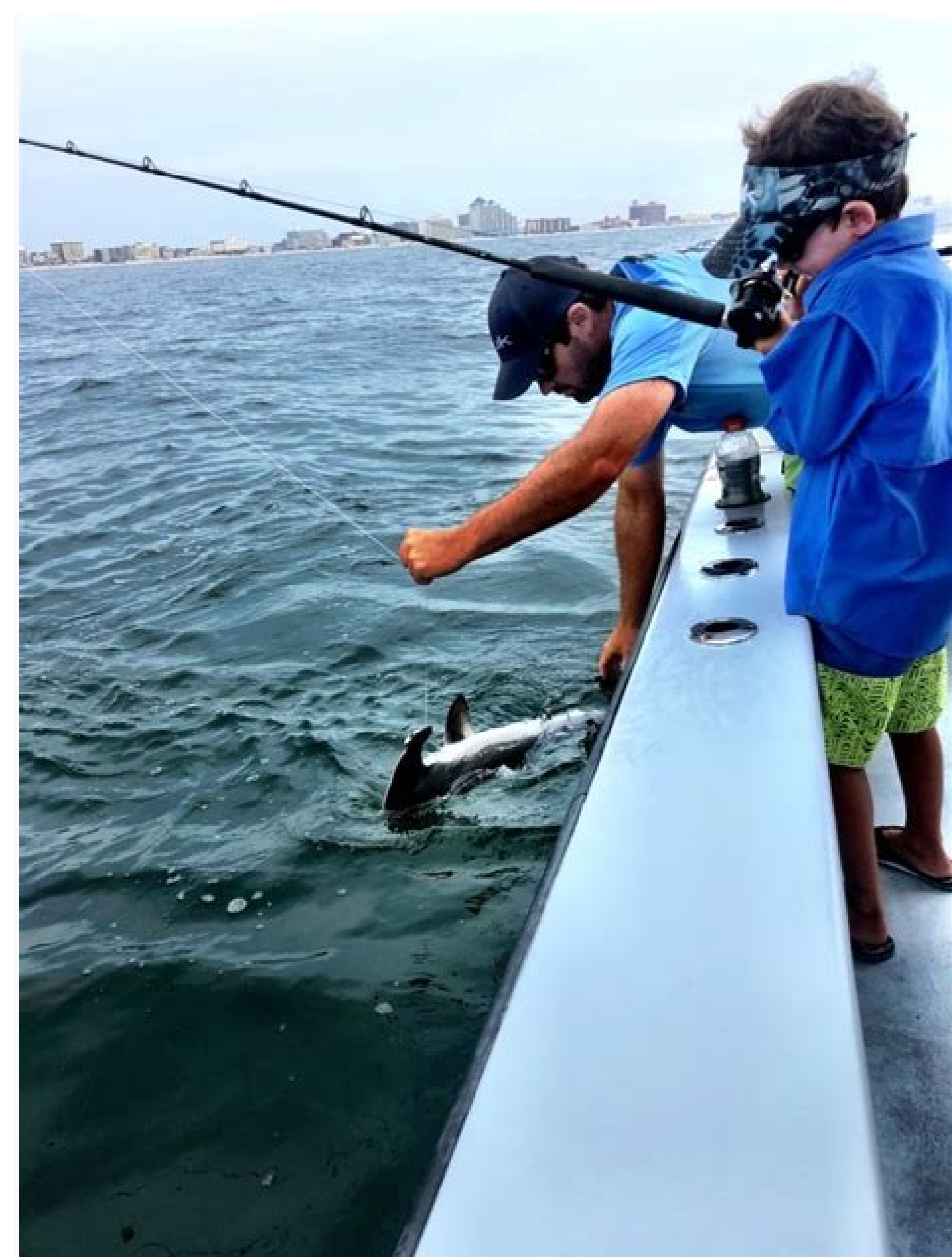
What fish are biting in ocean city md. How to find fishing spots in the ocean.